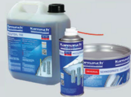
LUBRICANT AND CUTTING FLUIDS