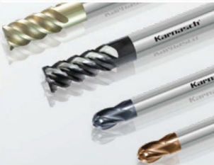
TITANIUM- STAINLESS- STEEL CUTTING