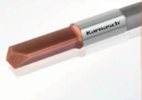
SOLID CARBIDE DRILLS TO REMOVE JAMMED TAPS