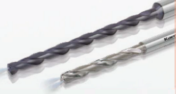
SOLID CARBIDE DRILLS