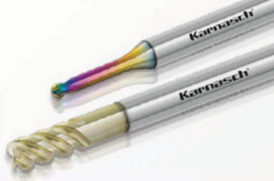
END MILLS/MICRO END MILLS SOLID CARBIDE - DIAMOND - PCD - CBN - CERMET - CVD