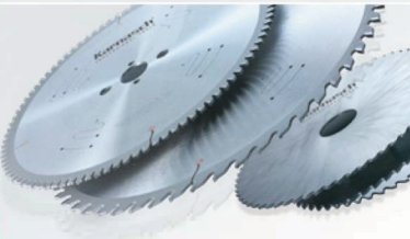
CIRCULAR SAW BLADES