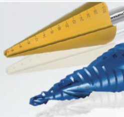
STEP DRILLS & TUBE AND SHEET DRILLS