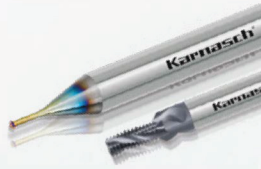
SOLID CARBIDE WHIRLING THREAD CUTTERS