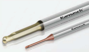
DENTAL TECHNOLOGY TOOLS