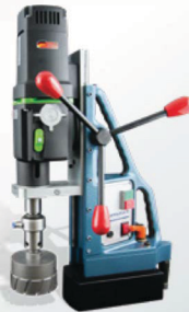
MAGNETIC HOLE CUTTING MACHINES