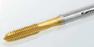
TAPS / MACHINE TAPS