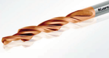
SUBLAND DRILLS / STUB SUBLAND DRILLS